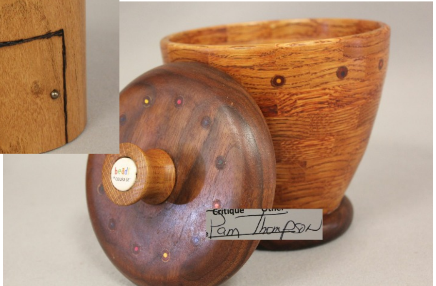
Etiquette Pam Thompson