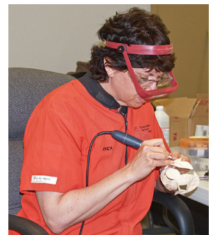
LEFT: The slow learners who required a two day class to learn woodburning and coloring between the lines.