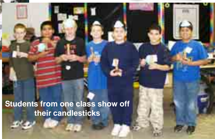
Students from one class show off their candlesticks