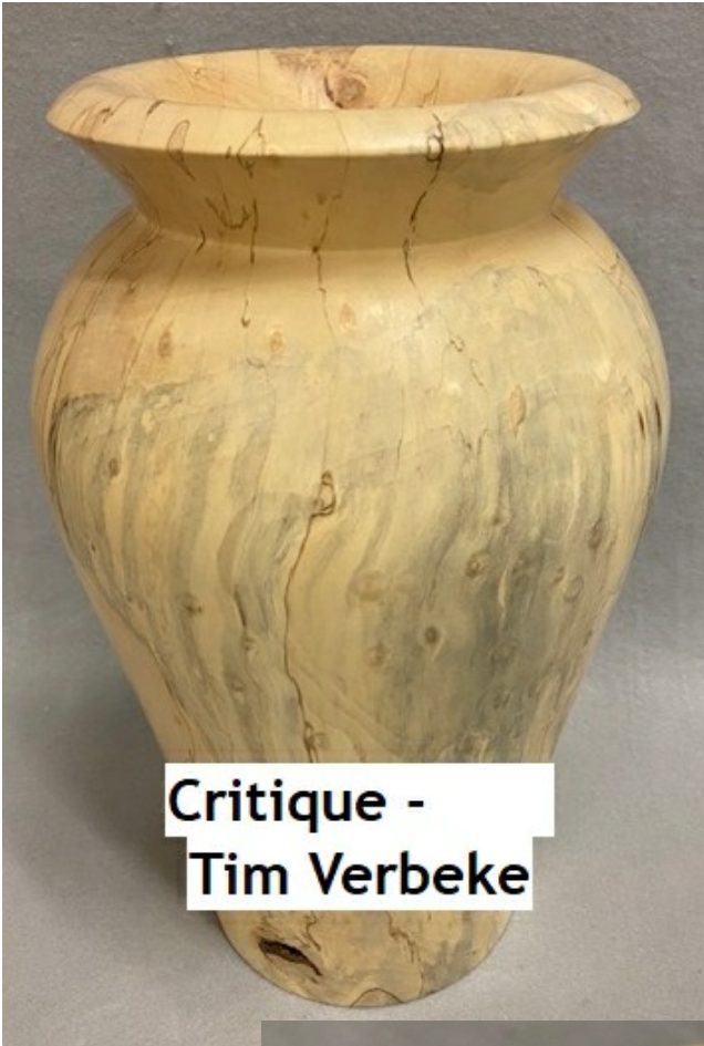
Critique - Tim Verbeke