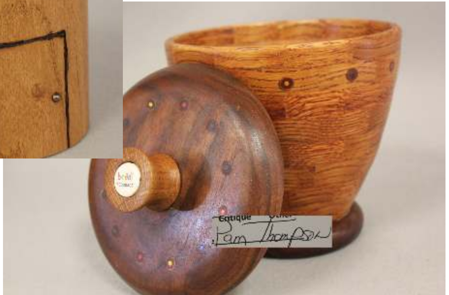
Etiquette Pam Thompson