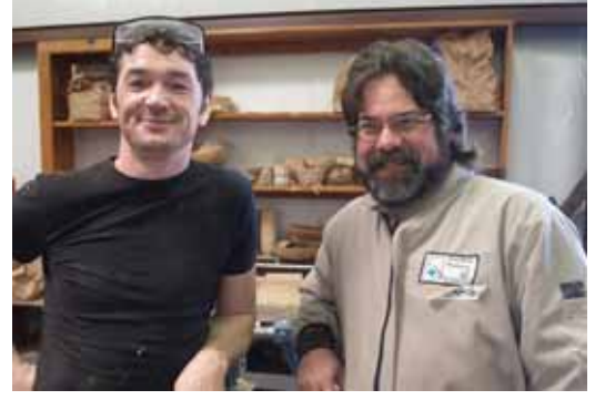
... continued on next page