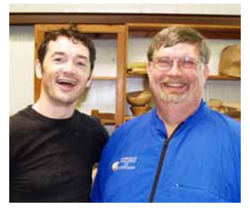
And ..... a great time was had by all!