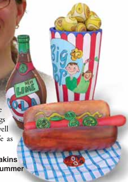
"A Fan's Plate" by artist Chelsea Deakins was featured in the Summer 2006 issue of American Woodturner Magazine